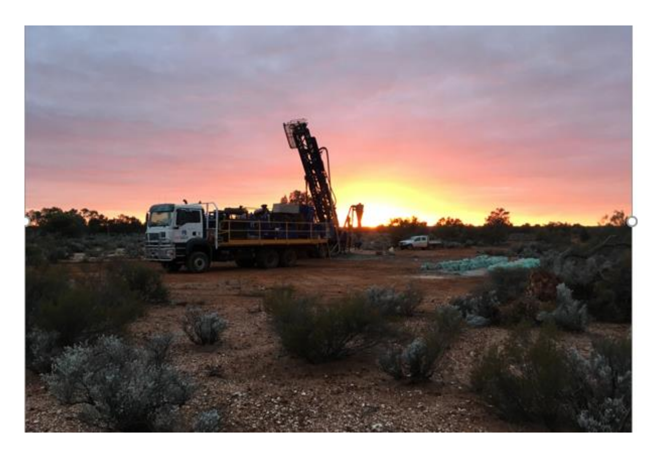
Photograph 1: Raglan Drilling Drill Rig at Red Mulga September 2018.

Information from the first drill program has confirmed mineralisation and the new data is being added to the geological model. Terrain continues to advance desk top studies at its Red Mulga prospect.