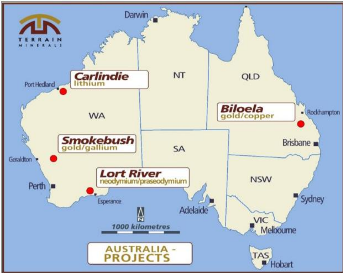
Diagram 2. Project location map.