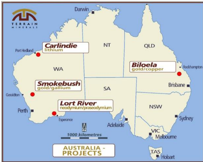
Diagram 2. Project location map.