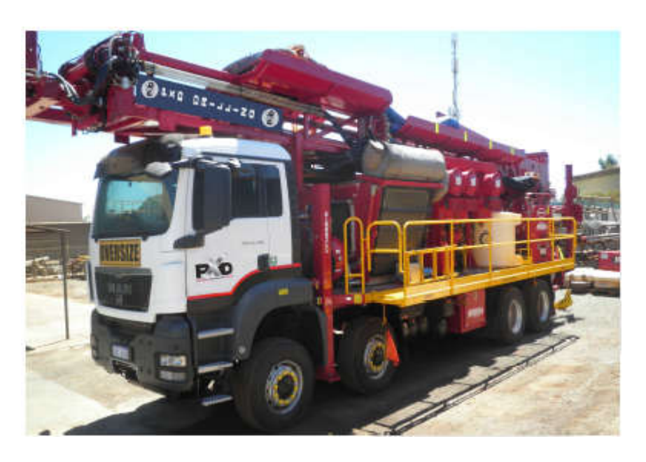
Picture 2. PDX Rig 3, Prior to Departing to the Great Western Gold Project.