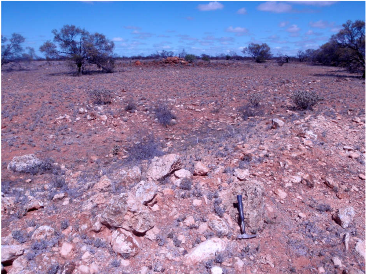
Photograph 2: Magnesite (foreground) forms an apron around outcrops of highly altered ultramafic units in the background at the MG1 anomaly.