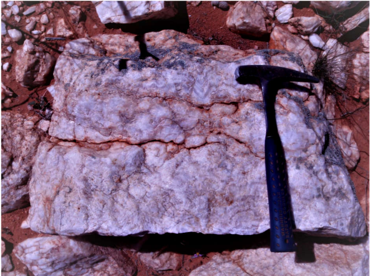
Photograph 3: Chalcedonic quartz in the Thumbo epithermal vein. The characteristic 'dogs tooth' intergrowth of crystals is common along the trend.