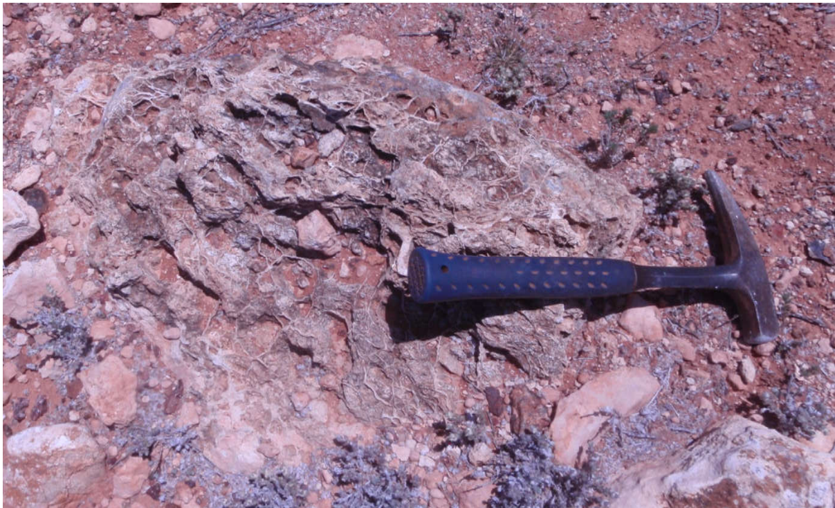
Photograph 1: The silcretised outcrops of the ultramafic rocks at the centre of the MG1 anomaly have a fibrous boxwork texture which may be derived from a massive sulphide or micro-breccia in the original rock.