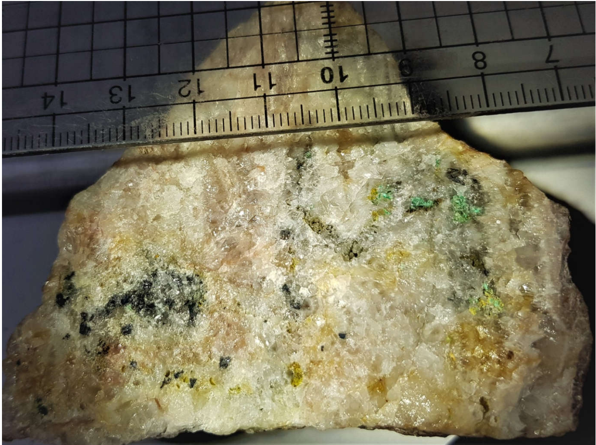
Photograph 4: Mineralised quartz from the Thumbo epithermal vein at rock chip sample site SO33. This sample returned 551ppm Cu (although much of the copper was lost during sampling), over 2000ppm Pb, 0.9g/t Ag and 84ppb Au.