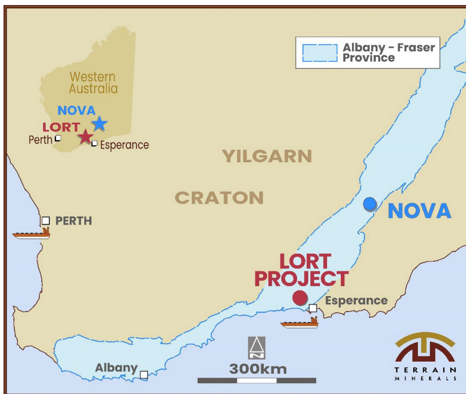
Figure 2. Terrain Minerals' 100% owned Lort River Project

Background: The Lort River Project is located within the Albany-Fraser Belt of Western Australia. This region is home to two important mining operations: AngloGold Ashanti's Tropicana Gold Mine and IGO's Nova-Bollinger Nickel-Copper Mine. IGO have stated that, based on their extensive exploration work, the entire Albany-Fraser Belt is prospective for Nova-style magmatic nickel-copper mineralisation. Based on this stated position from IGO, Terrain initiated its search for repetition of the Nova-Bollinger ore bodies in the southern section of the Belt.