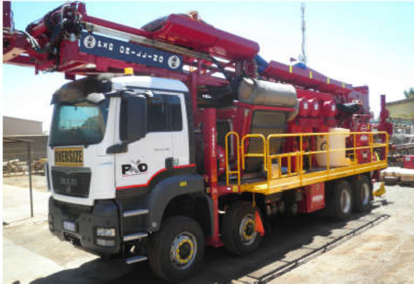
Picture 2. PDX Rig 3, Prior to Departing to the Great Western Gold Project.